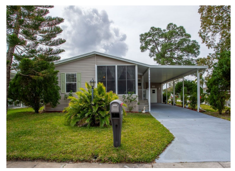
#46 2 BEDROOM 2 BATH $120,000