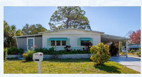
#286 2 BEDROOM 1 BATH $49,900