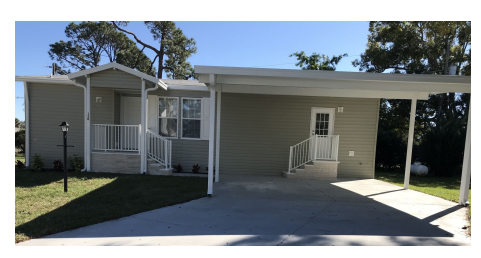
#53 2 BEDROOM, 2 BATH $149,900